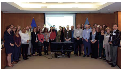
Participants at the training in Washington