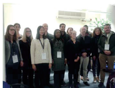
Participants at the training in Oxford.